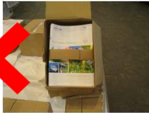
NOT ACCEPTABLE Books/Magazines/Catalogues are paper strapped and boxed