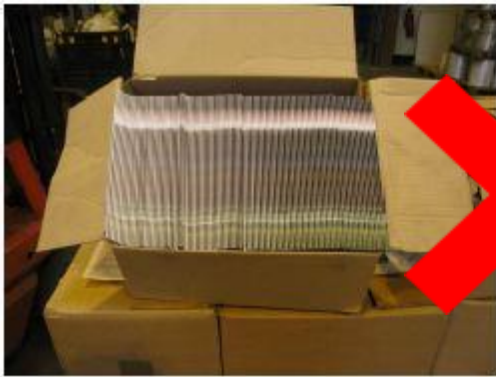
NOT ACCEPTABLE Books/Magazines/Catalogues are boxed