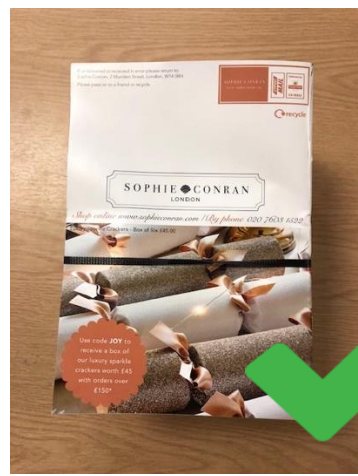
SINGLE STRAP Single strap if required