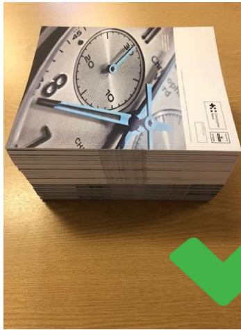
NO STRAPPING Ideal method of packaging