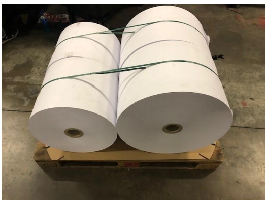
Strapped to pallet using suitable strapping.

All reels must be supplied strapped on pallets with suitable strapping and covering if needed – if covering is required it must have affixed label with clear description, reel size and weight.