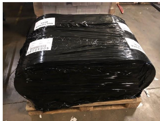
Suitably covered with clear description, reel size and weight.